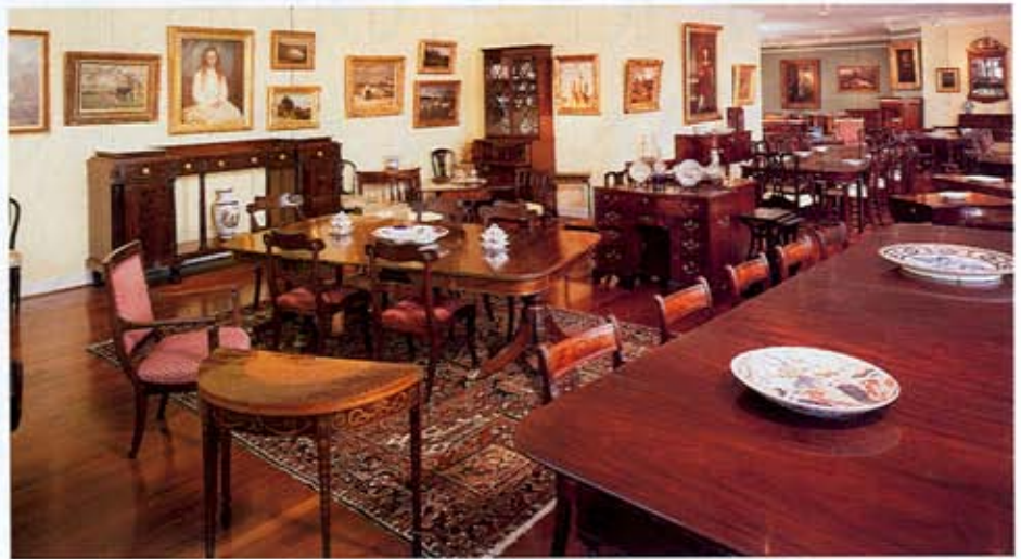
Brockett's Row Antiques and Fine Art specializes in American and English dining tables.